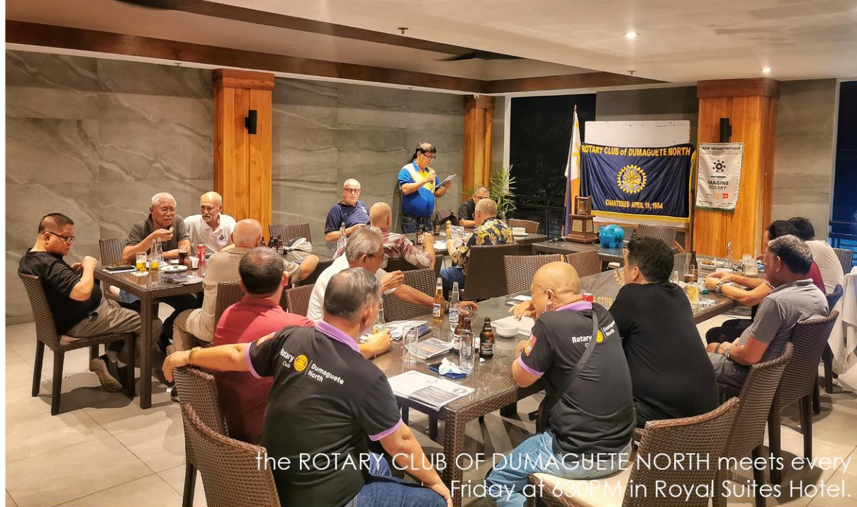
The ROTARY CLUB OF DUMAGUETE NORTH meets every Friday at 6:30 PM in Royal Suites Hotel.

10072022 - Friday Regular Meeting and Fellowship